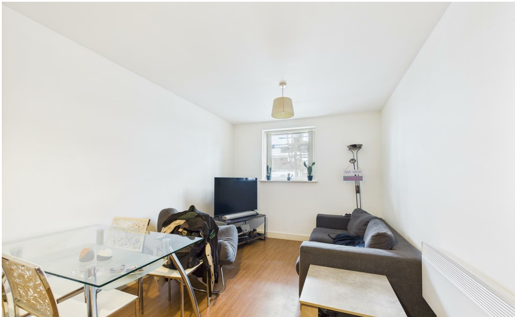
Apartment 947 58 Sherborne Street, Birmingham, B16 8FR £1,150 Per month